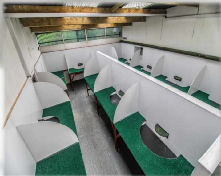
Our purpose-built Falcon Mews

Our newest venture, a state-of-the-art training and racing facility close to London. 2019 saw the first annual Vowley Race Day with competitors competing in the UK's only Tilwah Competition and the world's first ever "Falcon hunt Race"