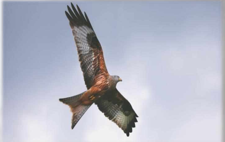
A wild red kite over the farm in Wales, continuing the success of the reintroduction in 1987

In 1985 the breeding population of Red Kites was down to 25 pairs, each pair seldom producing a single chick. So, Dr Nick Fox approached the Nature Conservation council and offered to assist in the breeding of the kites and release the youngsters back into the wild. In 1987 the first kites were reintroduced after artificial incubation at our farm in Carmarthenshire.