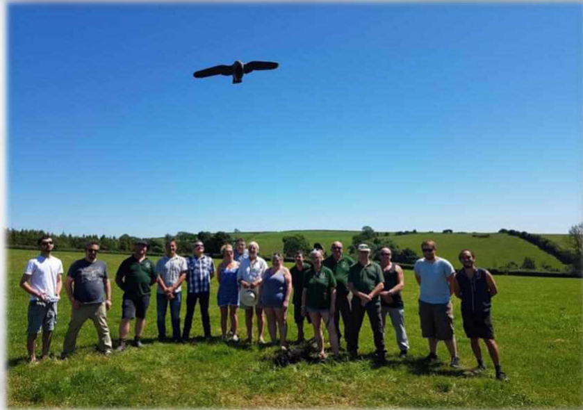
Staff, Interns and members of the Yorkshire Hawking Club after a day learning and flying