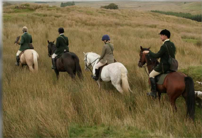
Riding out with the Northumberland Crow Falcons

During the months of August and September, the team move north to Northumberland and our surrounding hunting grounds for 2 months of mounted crow hawking with the Northumberland Crow Falcons.