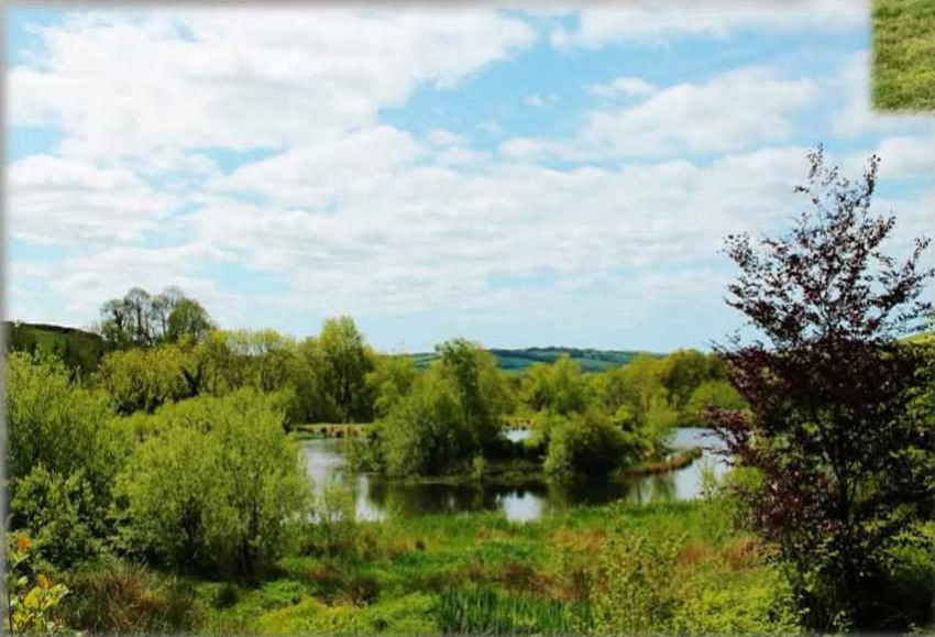
The largest of our lakes, home to beavers, water voles amongst other wildlife

Ongoing projects to reclaim farmland and return to natural woodlands by planting endemic species can be found across our 200 acres.