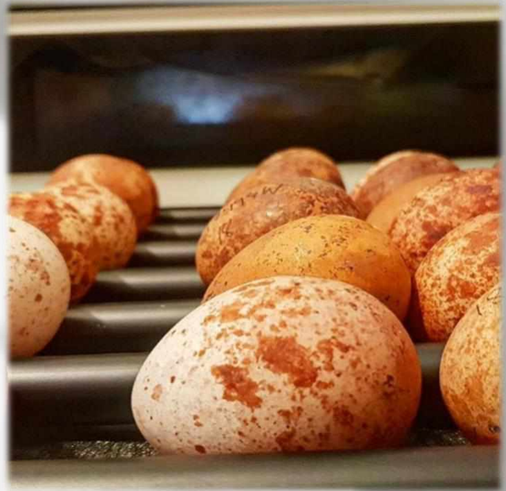
Peregrine Eggs in one of our incubators

Assisting in the processing of falcons during shipments as well as learning the basic paperwork aspects in addition to accompanying staff to deliver the falcons.