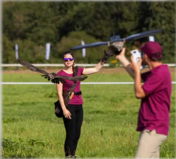
Falconer and Pilot launch at the start of the Hunt Race 2019