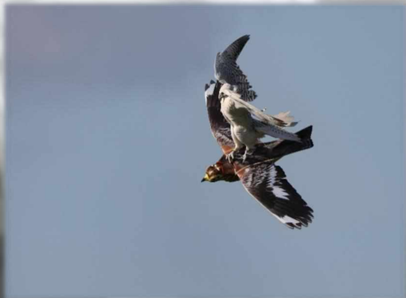
Gyr Falcon Binds to a RoKarrowan

RC Pilot or robotic enthusiasts can help produce models and try their skills at flying against one of our highly trained falcons.