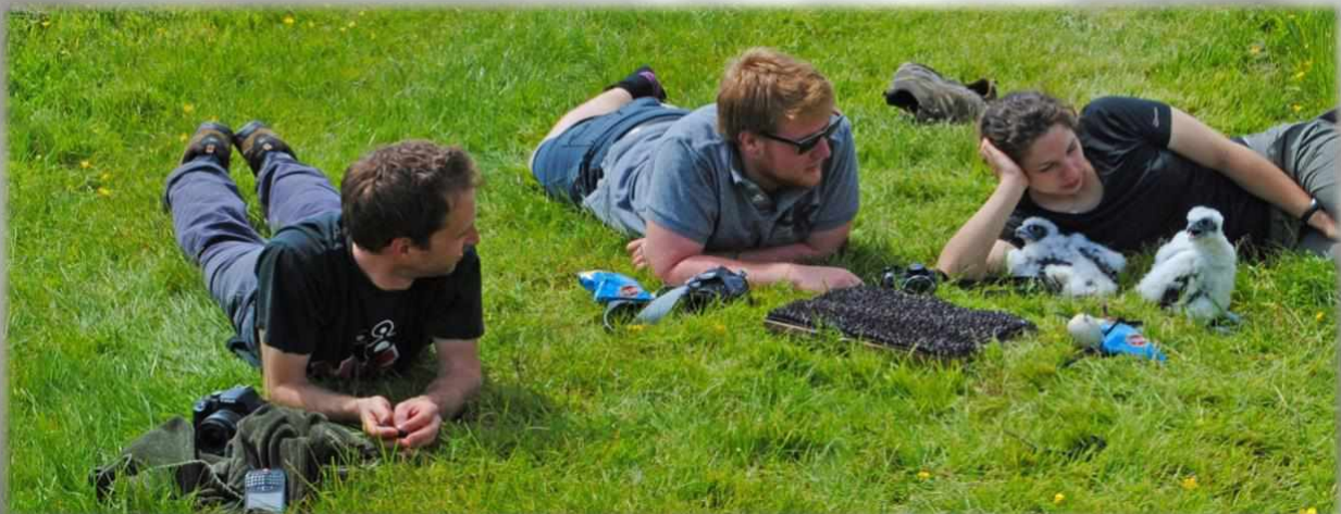
Staff and Interns relaxing with some of the newest recruits