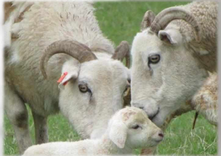
Members of our Wiltshire Horn herd welcoming a new member