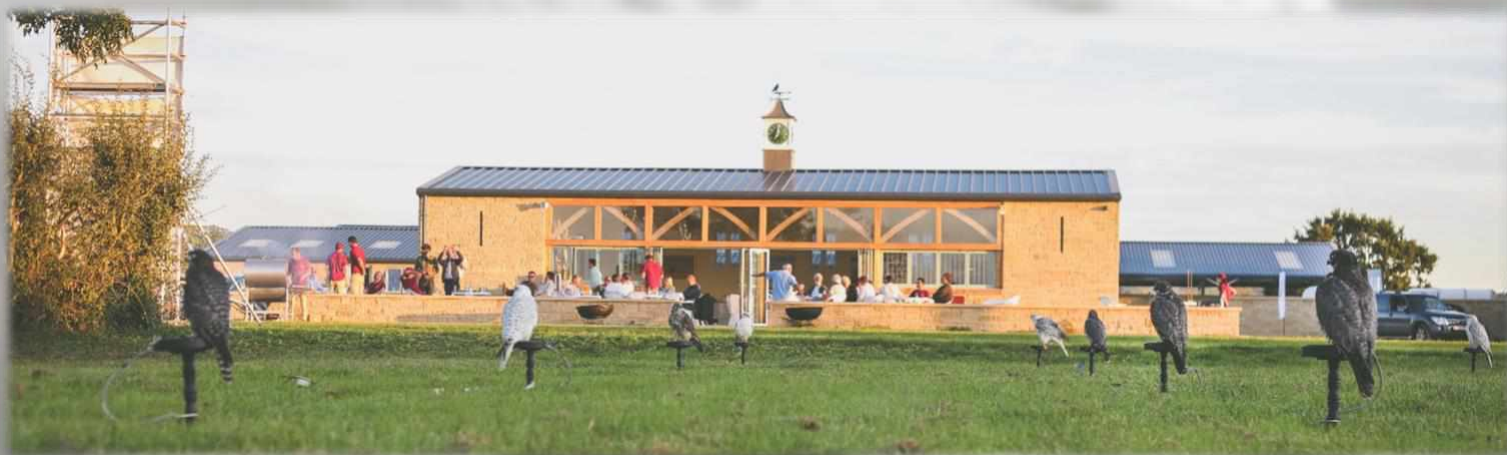
The weathering lawn at the first international Vowley Race Day

Falconry Interns will be involved in all aspects of Falcon training, from the initial manning process and basic training, right up until they are shipped to clients or used for hunting or competitions in the UK.