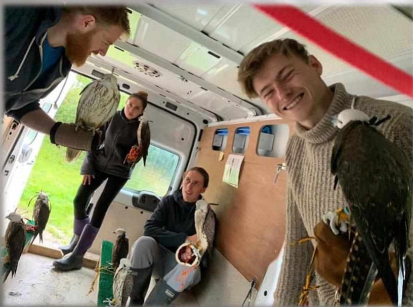
Staff and interns during a falcon shipment