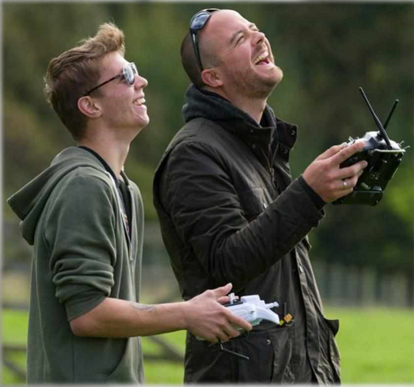
Pilots enjoying a day's flying the roprey models

As well as producing Roprey models for falconry use, Wingbeat has been developing Ropredators for bird deterrence. Wingbeat produce models that mimic any medium to large sized raptor, with Peregrines and Goshawks proving to be the most popular.