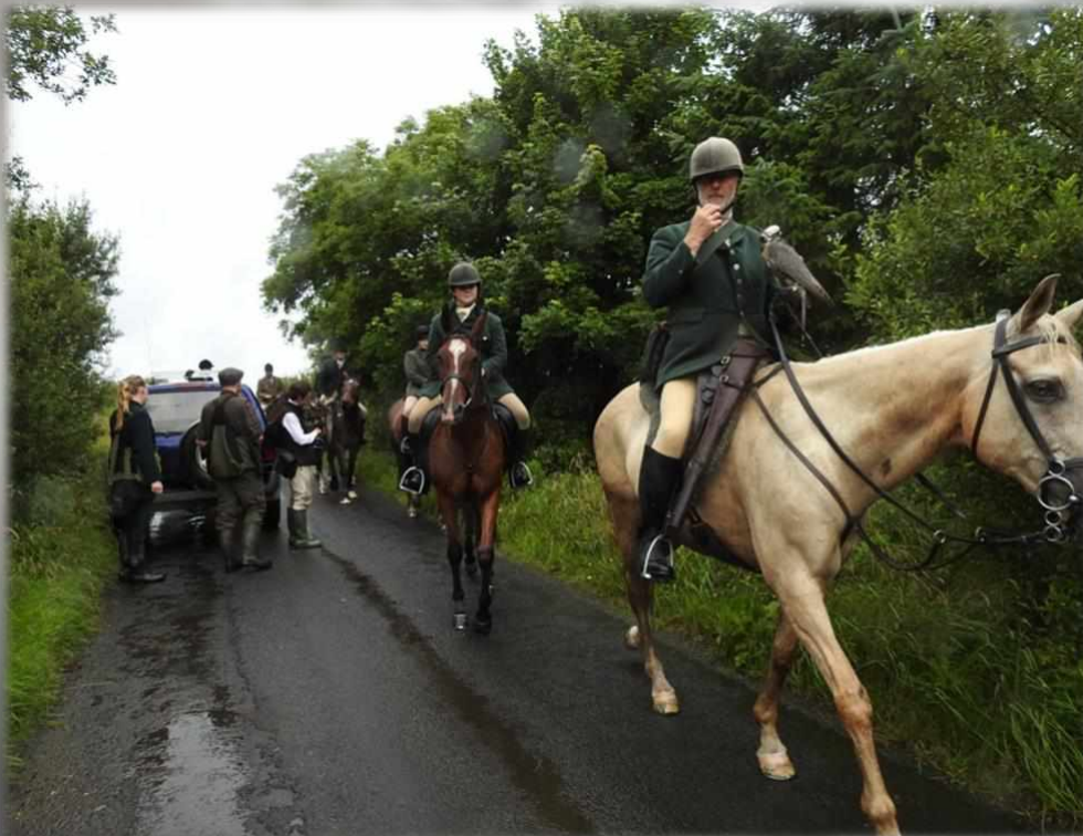
Horses and Falcons ready for a day's hawking