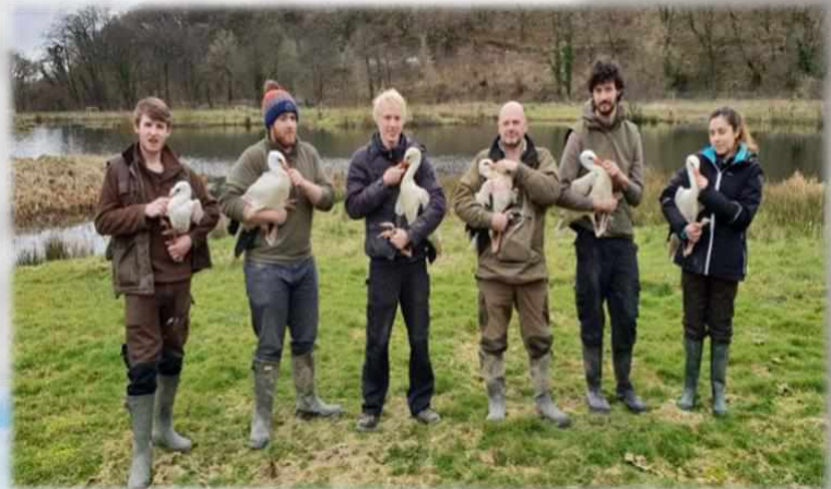
Staff and Interns with the first of the white storks

A group of 6 storks brought in from Poland, all wild injured due to electrocution are hopefully the start of our on-site breeding programme. Grounds maintenance and observation of the storks is a year-round project.