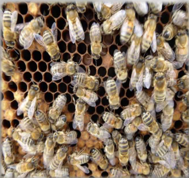
One of our Honey Bee Hives located on the farms