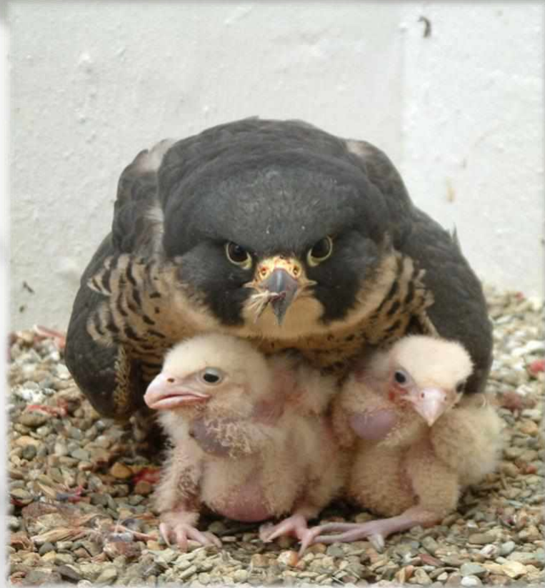
A protective mother Peregrine Falcon and her young chicks