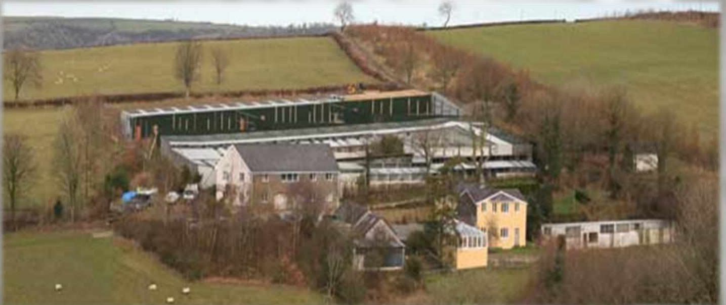
The main facility, Wales