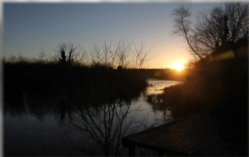
Sunset from one of our many wildlife hides