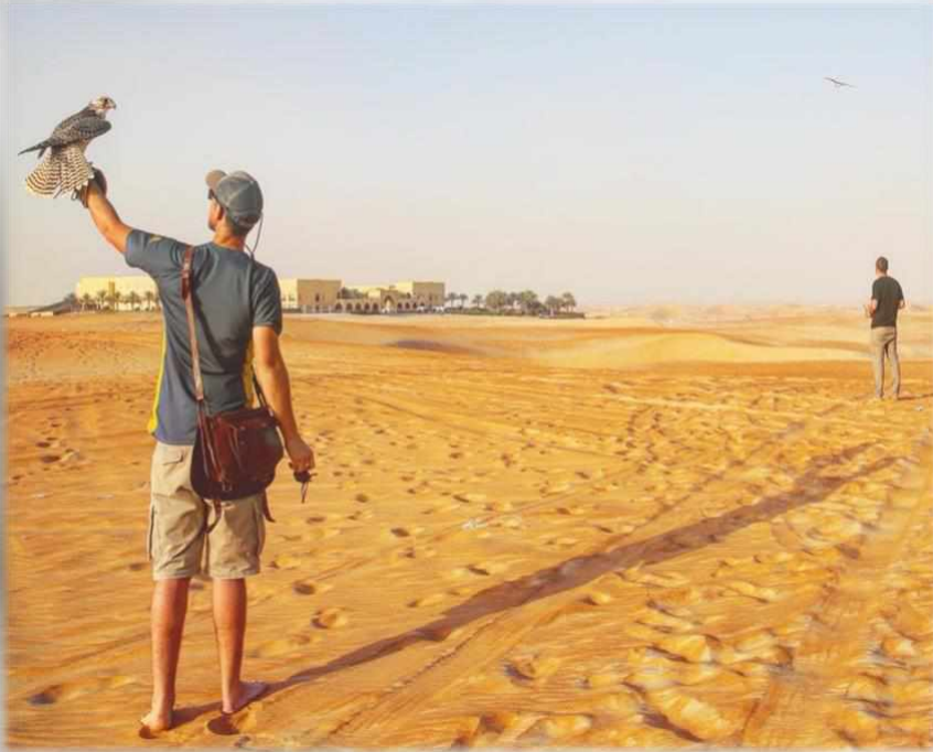
Slipping a falcon in the UAE Desert