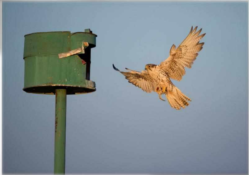
A wild Mongolian Saker using one of the artificial nest sites created from old Orange juice barrels in the steppes of Mongolia

A pilot scheme was established in 2011 using captive bred Saker Falcons from Germany and Czech Republic. Falcons were released into the Balkan region of Bulgaria and satellite tracked. Since then, developments have meant Saker falcons have successfully been bred in captivity in Bulgaria at the Green Balkans Facility and it was reported in 2019 the first wild Sakers have successfully bred in Bulgaria from falcons bred for this project.