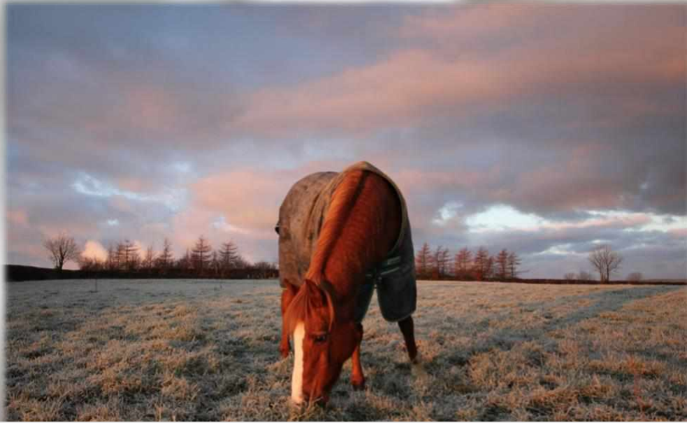
Dance-Away, one of our Arab horses enjoying the frosty Welsh grass

The opportunity to ride with the Northumberland Crow Falcons on meet days may be possible if riding is of high enough standard. Possibility to learn some basic aspects of falcon training may occur also.