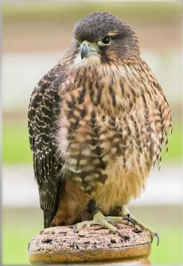
A Male New Zealand Falcon

Interns are able to get a hands-on learning experience with fully trained, dedicated aviculturists.