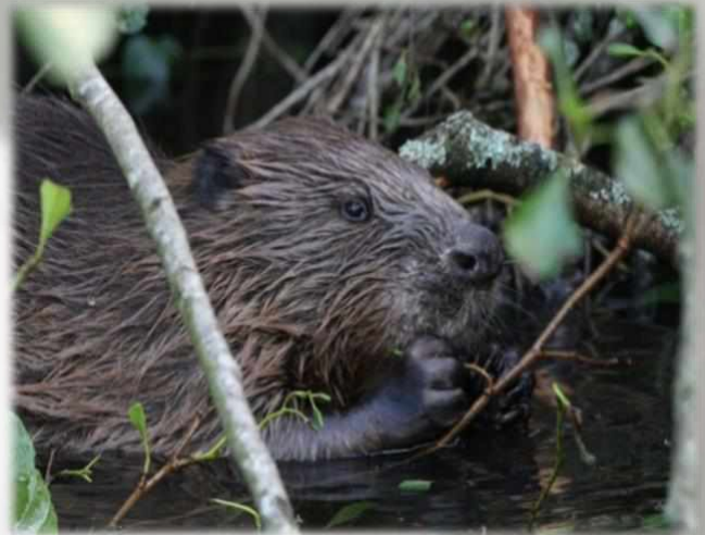
An Adult Beaver on one of our many lakes situated on the farms.

With 4 pairs of breeding beavers on our man-made lakes, the upkeep and maintenance of the habitats is an ongoing project. Beavers must be monitored daily, yearlings relocated, and kits processed so the work can be very much hands on.