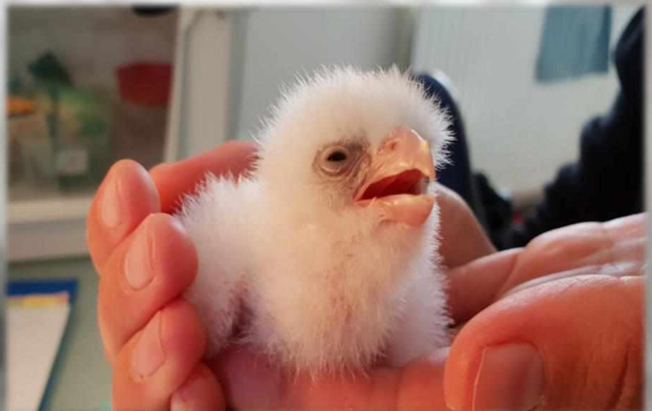
The first feed of the day for this young Falcon

Observing trained staff incubate over 500 eggs in a specifically designed incubation room