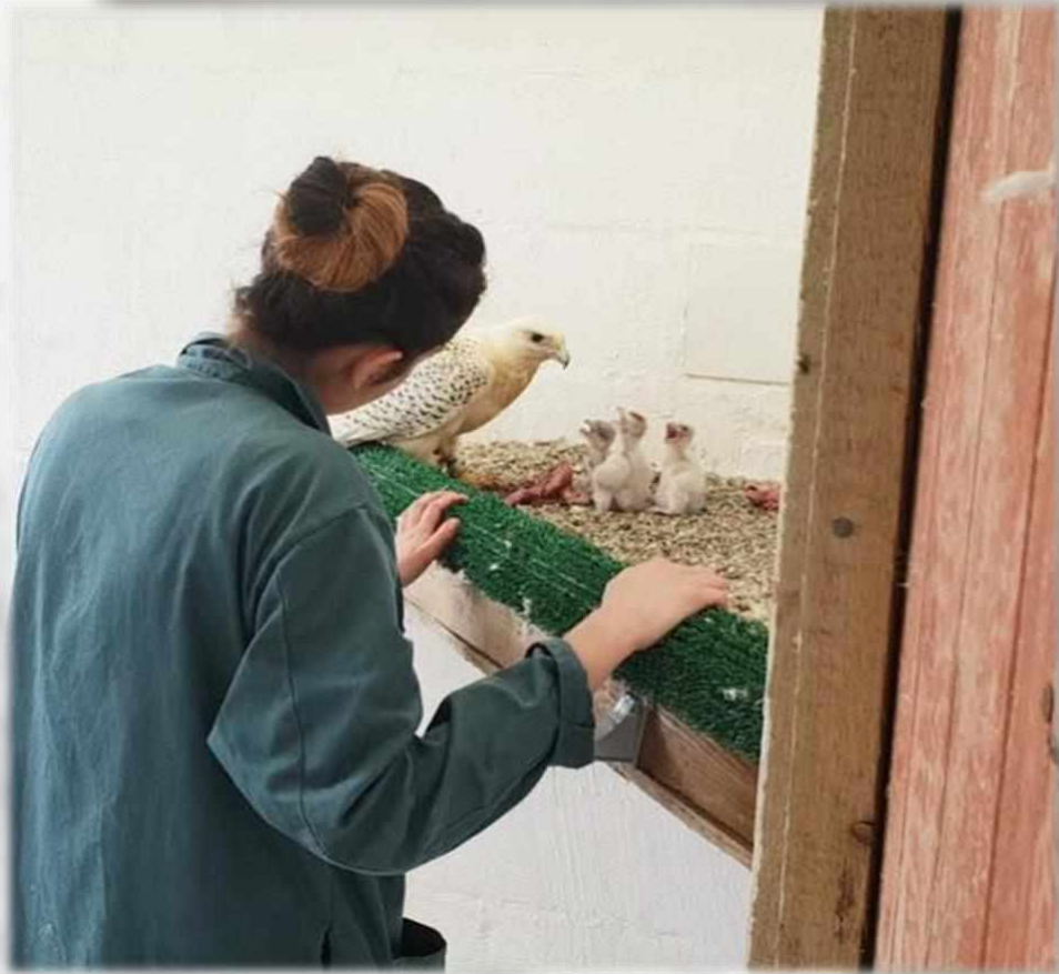
Helping a young mother with her new chicks

Kingdom, United Arab Emirates, Qatar, Saudi Arabia and Kuwait since 1987.