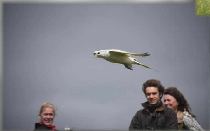
Watching a young Gyr Falcon play in the wind