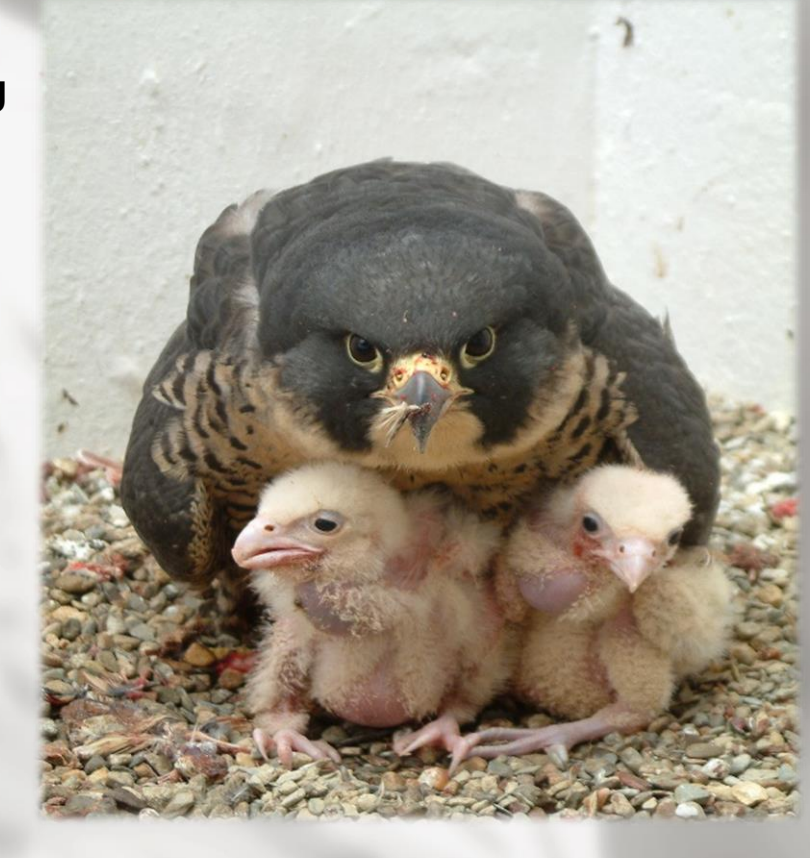
A protective mother Peregrine Falcon and her young chicks