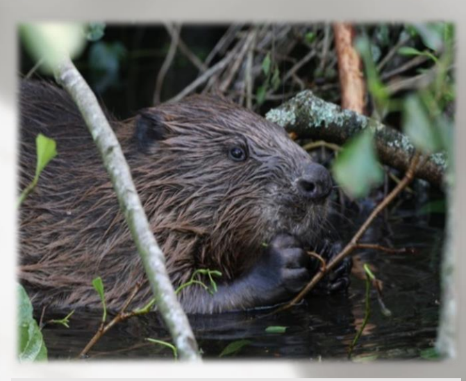
An Adult Beaver on one of our many lakes situated on the farms

With 4 pairs of breeding beavers on our manmade lakes, the upkeep and maintenance of the habitats is an ongoing project. Beavers must be monitored daily, yearlings relocated, and kits processed so the work can be very much hands on.