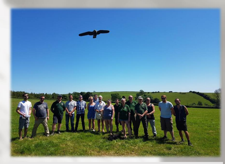
Staff, Interns and members of the Yorkshire hawking Club after a day learning and flying