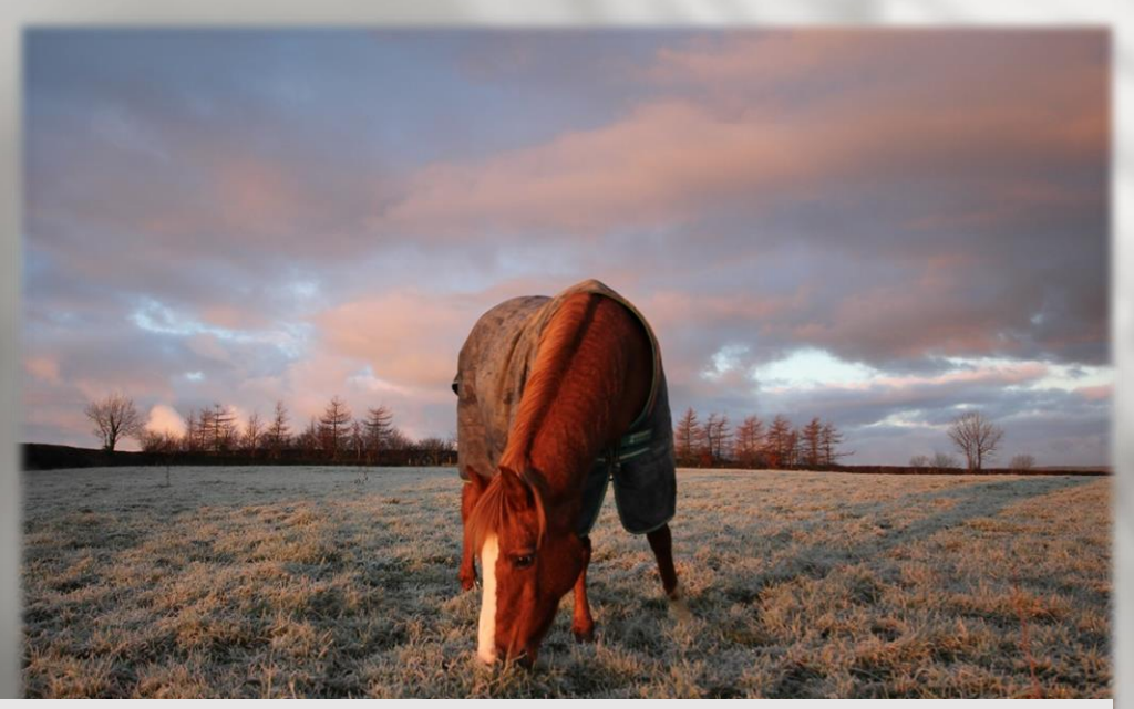
Dance-Away, one of our Arab horses enjoying the frosty Welsh grass

The opportunity to ride with the Northumberland Crow Falcons on meet days may be possible if riding is of high enough standard. Possibility to learn some basic aspects of falcon training may occur also.