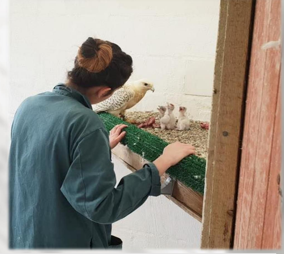
Helping a young mother with her new chicks

Established in 1985, we are one of the Britain's longest established breeding facilities, producing high quality falcons for Royal Families of the United