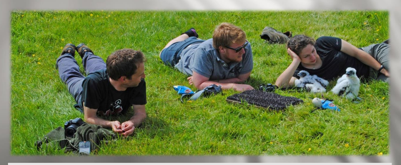
Staff and Interns relaxing with some of the newest recruits

*Based in the beautiful countryside of Carmarthenshire, close to Pembrokeshire Coastline, Preseli Mountains, Skomer Island and Brecon Beacons National Park