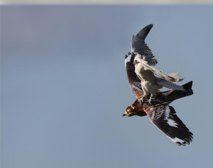
Gyr Falcon Binds to a RoKarrowan

Manufactured and designed in a purpose-built factory on site by highly skilled staff. Models vary from Crows, Pheasant and Gulls but can be painted anyway you can imagine!