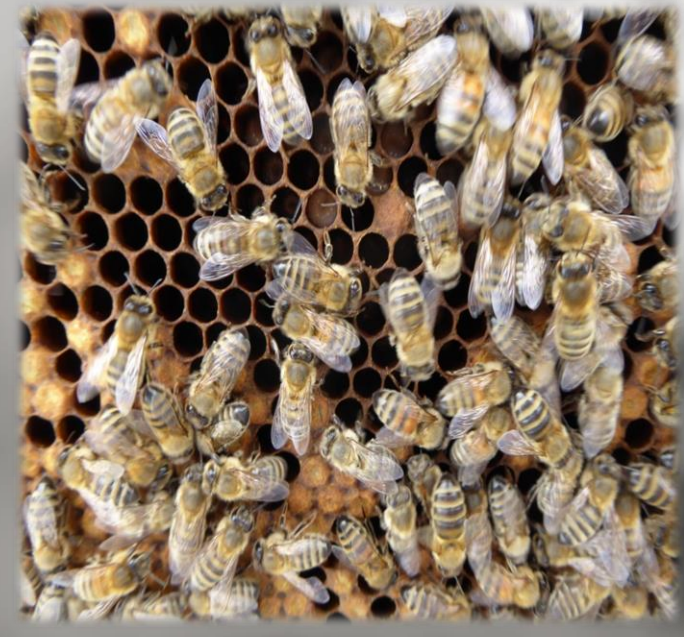
One of our Honey Bee Hives located on the farms