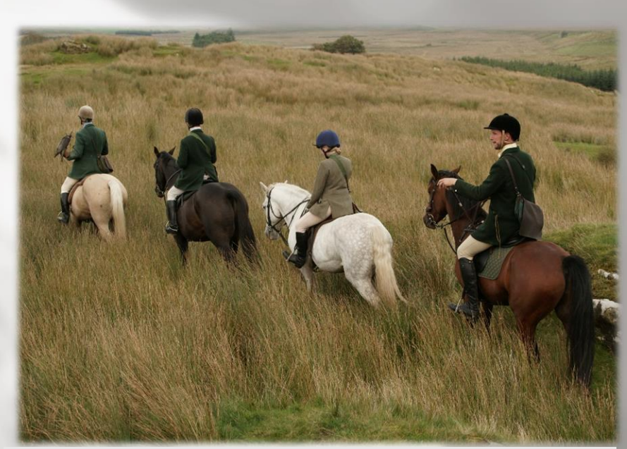
Riding out with the Northumberland Crow Falcons

During the months of August and September, the team move north to Northumberland and our surrounding hunting grounds for 2 months of mounted crow hawking with the Northumberland Crow Falcons.