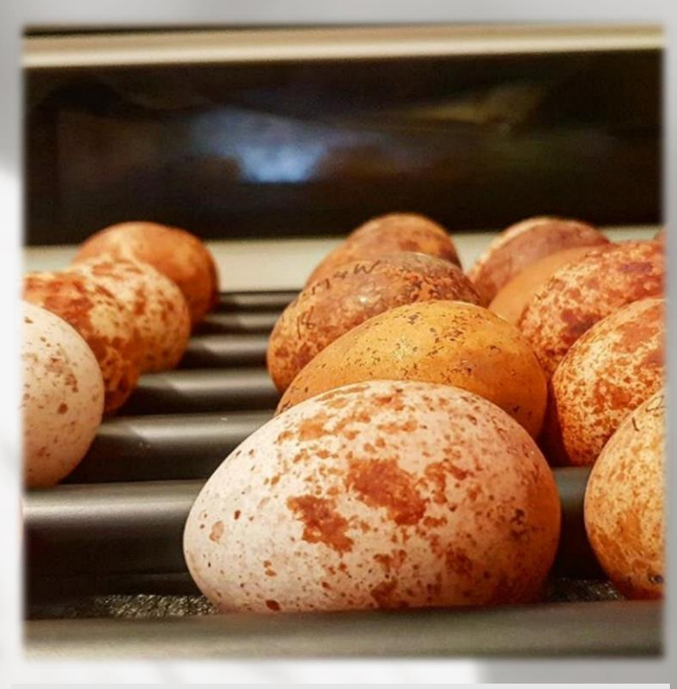
Peregrine Eggs in one of our many incubators