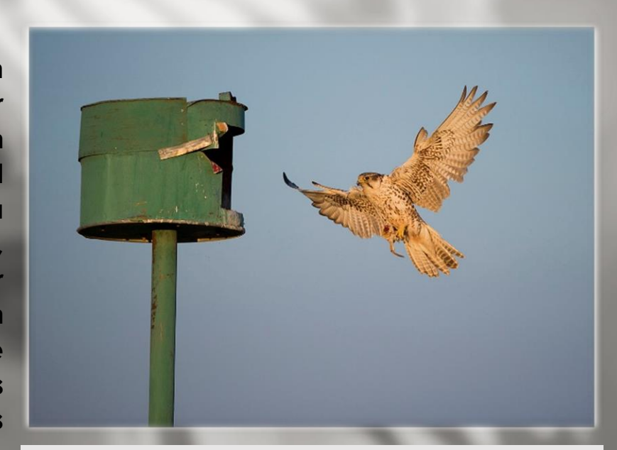
A wild Mongolian Saker using one of the artificial nest sites created from old Orange juice barrels in the steppes of Mongolia

A pilot scheme was established in 2011 using captive bred Saker Falcons from Germany and Czech Republic. Falcons were released into the Balkan region of Bulgaria and satellite tracked. Since then, developments have meant Saker falcons have successfully been bred in captivity in Bulgaria at the Green Balkans Facility and it was reported in 2019 the first wild Sakers have successfully bred in Bulgaria from falcons bred for this project.