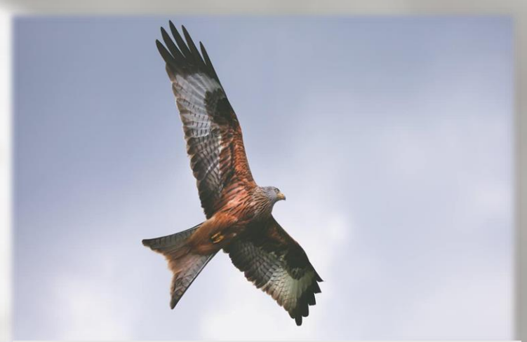
A wild red kite over the farm in Wales, continuing the success of the reintroduction in 1987

In 1985 the breeding population of Red Kites was down to 25 pairs, each pair seldom producing a single chick. So, Dr Nick Fox approached the Nature Conservation council and offered to assist in the breeding of the kites and release the youngsters back into the wild. In 1987 the first kites were reintroduced after artificial farm incubation at our Carmarthenshire.