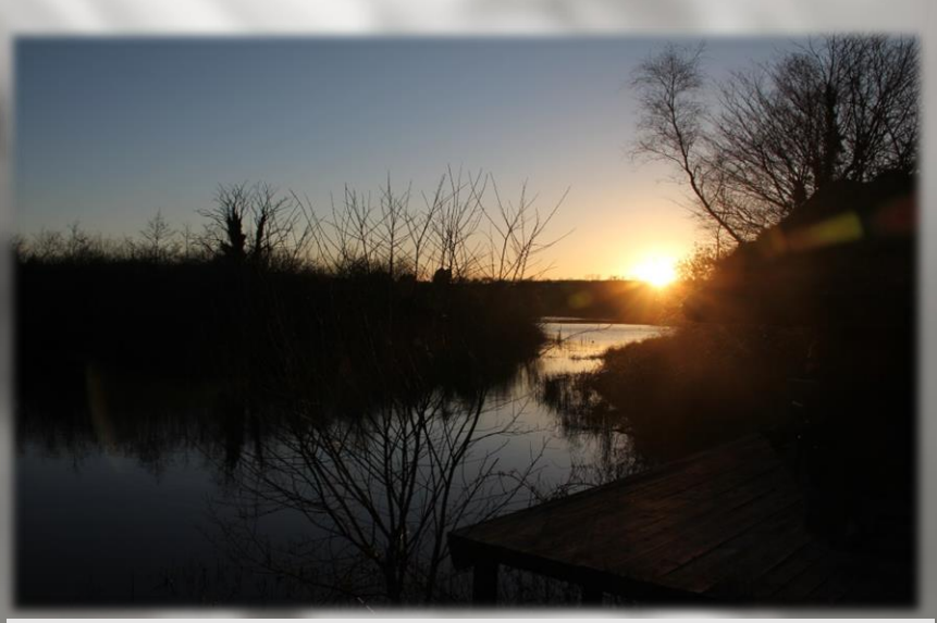
Sunset from one of our many wildlife hides