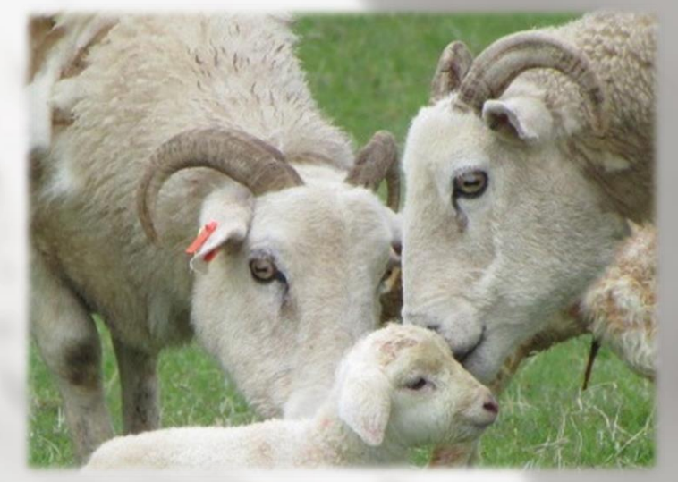
Members of our Wiltshire Horn herd welcoming a new member

*Based in the beautiful countryside of Carmarthenshire, close to Pembrokeshire Coastline, Preseli Mountains, Skomer Island and Brecon Beacons National Park