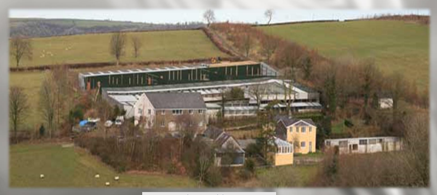
The main facility, Wales