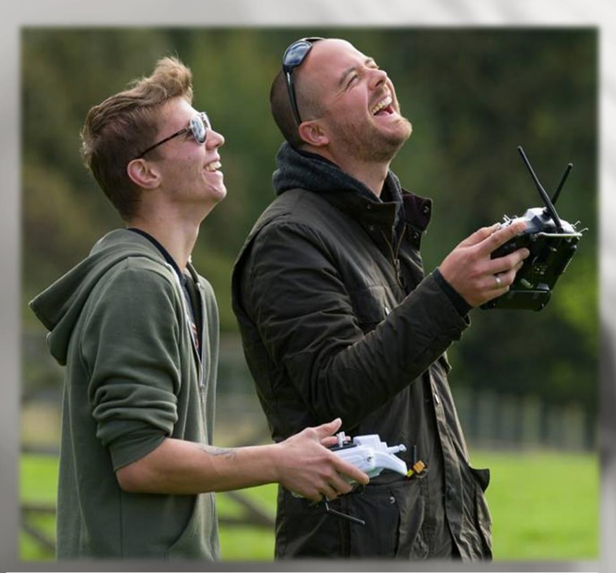
Pilots enjoying a day's flying the roprey models

RC Pilot or robotic enthusiasts can help produce models and try their skills at flying against one of our highly trained falcons.