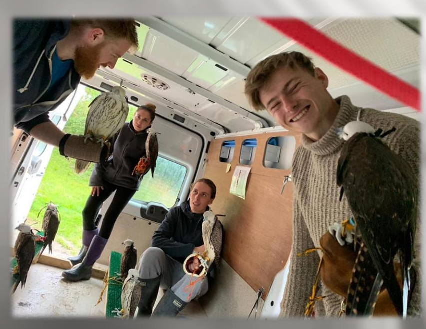
Staff and interns during a falcon shipment