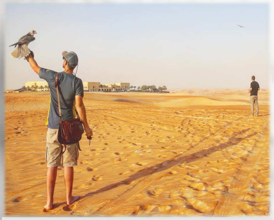
Slipping a falcon in the UAE Desert

https://www.facebook.com/IWCUK/https://www.instagram.com/iwc_uk/