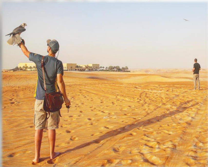
Slipping a falcon in the UAE Desert