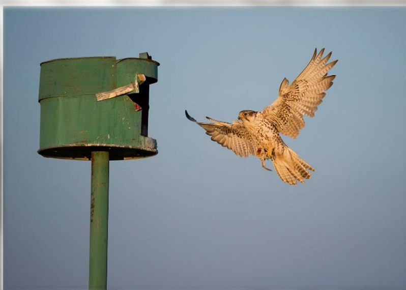
A wild Mongolian Saker using one of the artificial nest sites created from old Orange juice barrels in the steppes of Mongolia

A pilot scheme was established in 2011 using captive bred Saker Falcons from Germany and Czech Republic. Falcons were released into the Balkan region of Bulgaria and satellite tracked. Since then, developments have meant Saker falcons have successfully been bred in captivity in Bulgaria at the Green Balkans Facility and it was reported in 2019 the first wild Sakers have successfully bred in Bulgaria from falcons bred for this project.