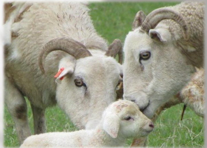
Members of our Wiltshire Horn herd welcoming a new member