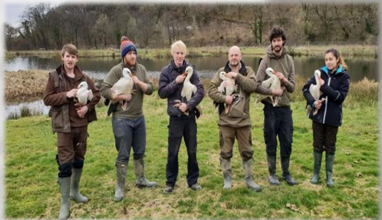
Staff & Interns with the first of the white storks

A group of 6 storks brought in from Poland, all wild injured due to electrocution are hopefully the start of our on-site breeding programme. Grounds maintenance and observation of the storks is a year-round project.