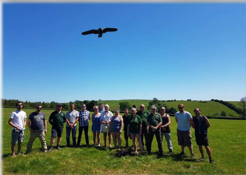
Staff, Interns and members of the Yorkshire hawking Club after a day learning and flying