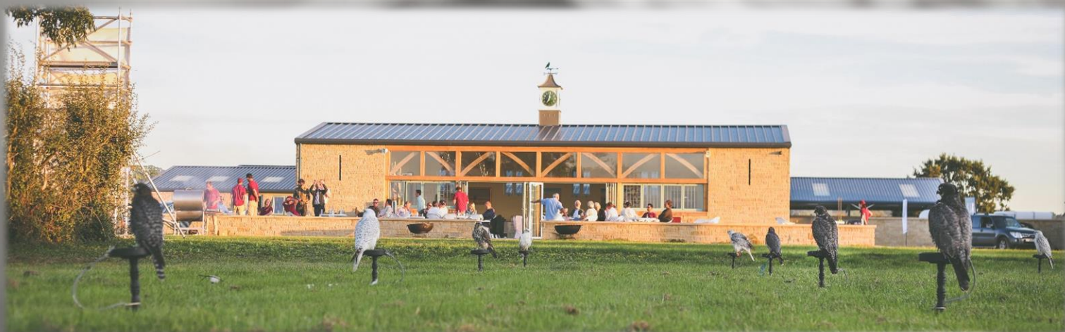
The weathering lawn at the first international Vowley Race Day