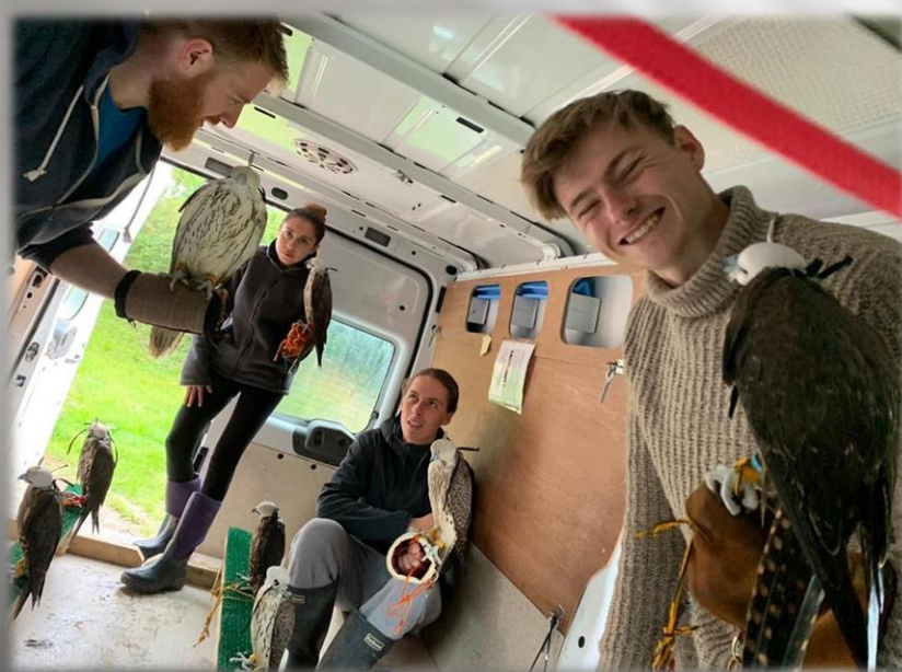
Staff and interns during a falcon shipment