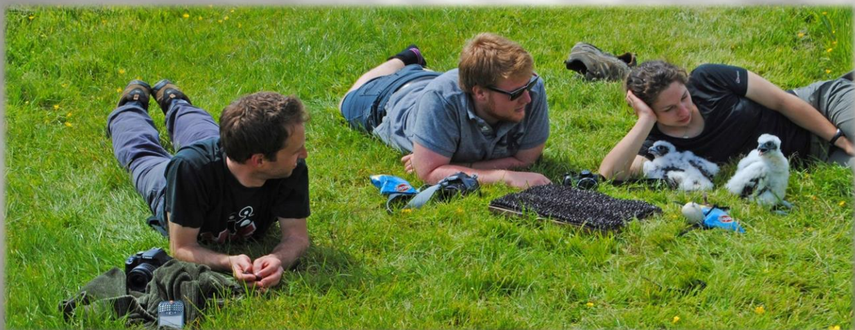
Staff and Interns relaxing with some of the newest recruits