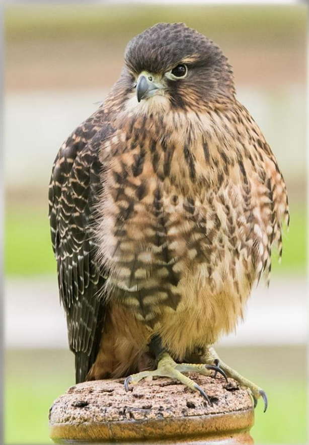
Male New Zealand Falcon

Interns are able to get a hands-on learning experience with fully trained, dedicated aviculturists.