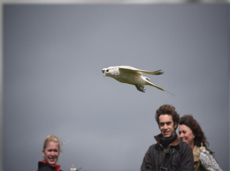
Watching a young Gyr falcon play in the wind