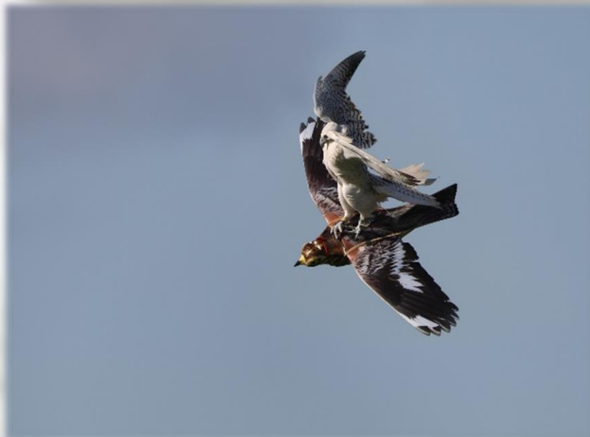
Gyr Falcon binds to a RoKarrowan

RC Pilot or robotic enthusiasts can help produce models and try their skills at flying against one of our highly trained falcons.