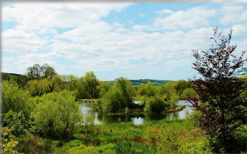
The largest of our lakes, home to beavers, water voles amongst other wildlife

Ongoing projects to reclaim farmland and return to natural woodlands by planting endemic species can be found across our 200 acres.