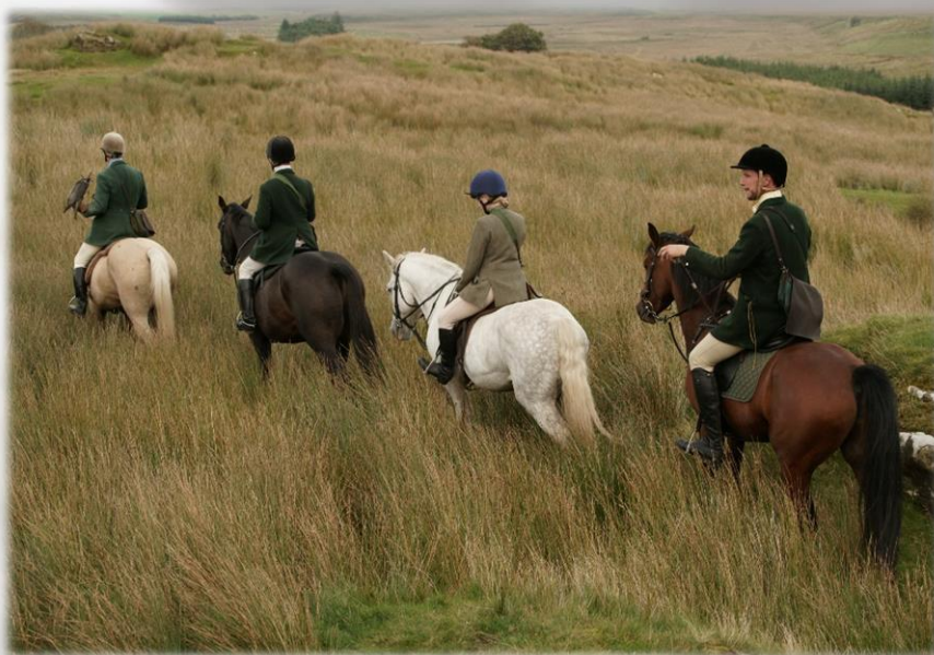
Riding out with the Northumberland Crow Falcons

During the months of August and September, the team move north to Northumberland and our surrounding hunting grounds for 2 months of mounted crow hawking with the Northumberland Crow Falcons.