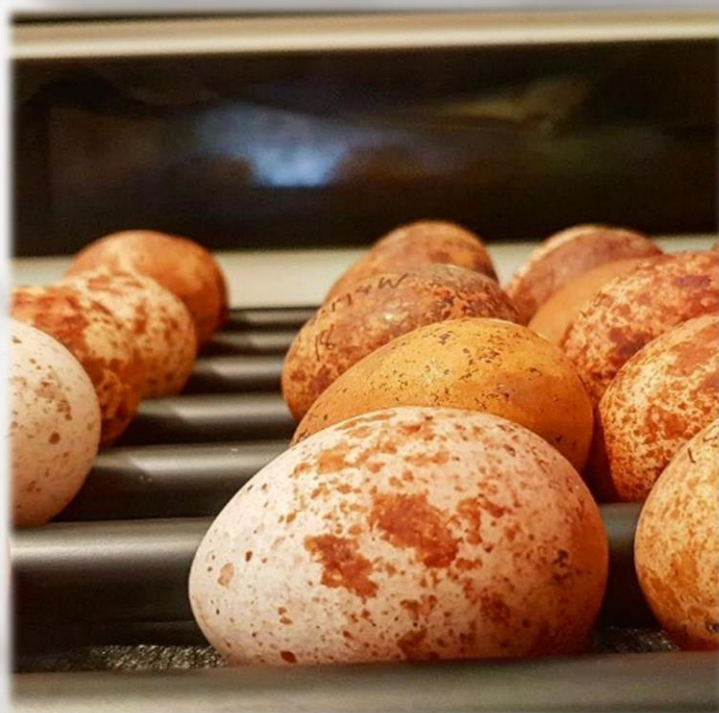
Peregrine Eggs in one of our many incubators

Assisting in the processing of falcons during shipments as well as learning the basic paperwork aspects in addition to accompanying staff to deliver the falcons.