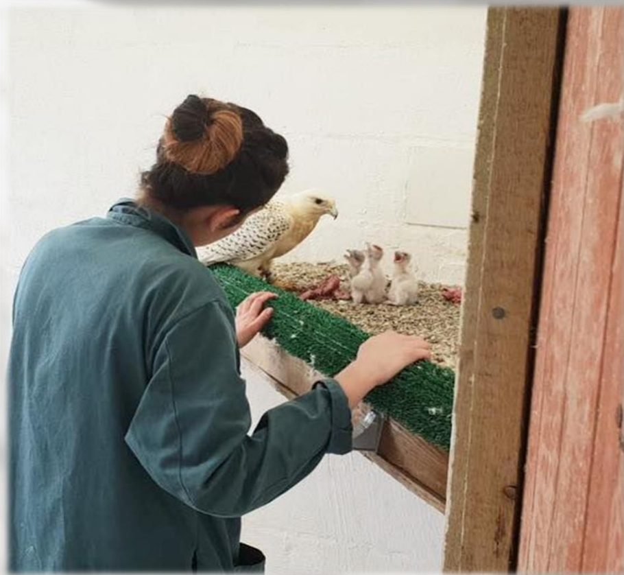
Helping a young mother with her new chicks

Established in 1985, we are one of the Britain's longest established breeding facilities, producing high quality falcons for Royal Families of the United Kingdom, United Arab Emirates, Qatar, Saudi Arabia and Kuwait since 1987.