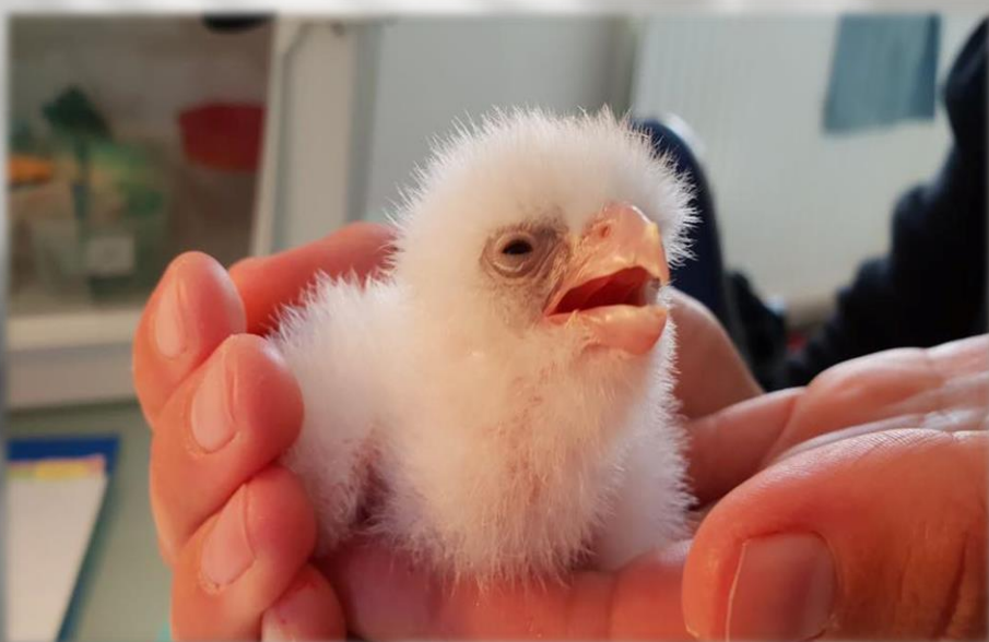
The first feed of the day for this young Falcon