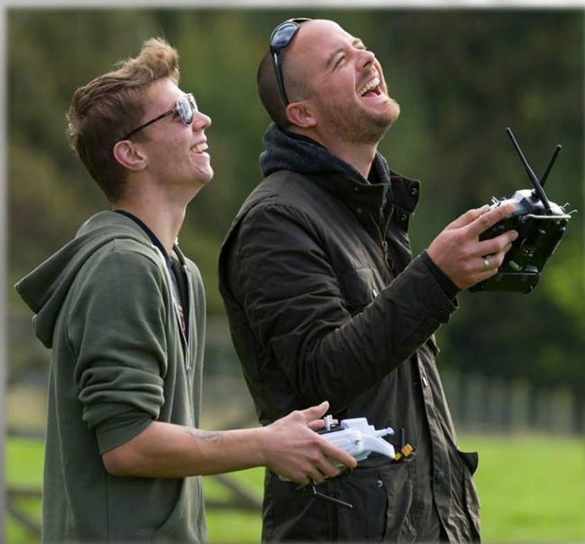
Pilots enjoying a day's flying the roprey models

As well as producing Roprey models for falconry use, Wingbeat has been developing Ropredators for bird deterrence. Wingbeat produce models that mimic any medium to large sized raptor, with Peregrines and Goshawks proving to be the most popular.