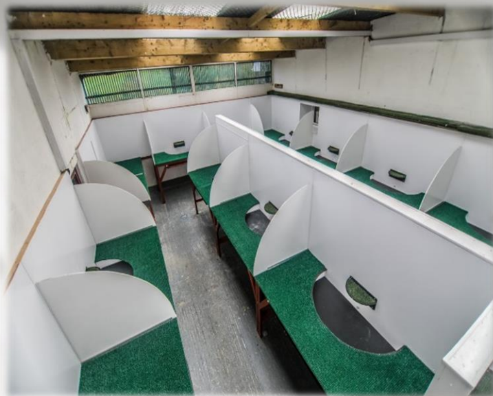
Our purpose-built Falcon Mews

For anyone interested in a career with falcons, there is no better internship to add to your CV.