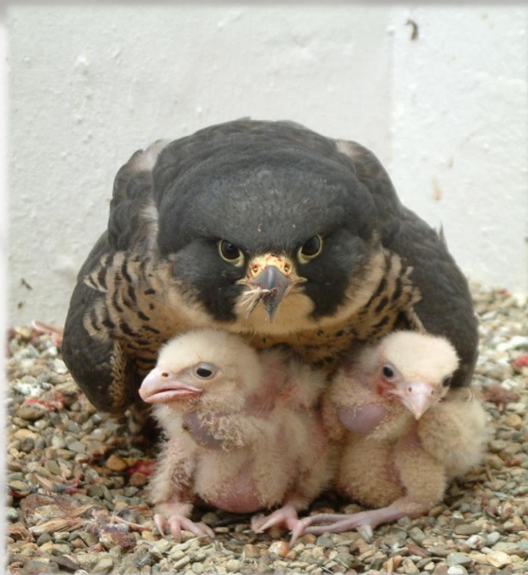
A protective mother Peregrine Falcon and her young chicks