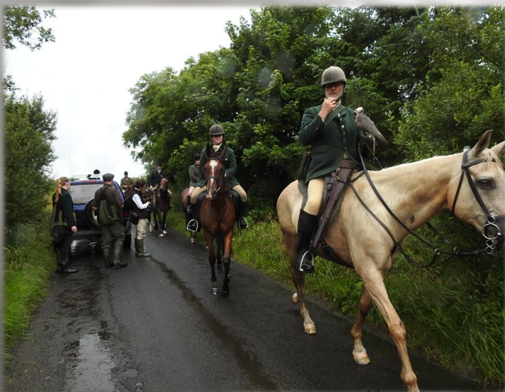
Horses and Falcons ready for a day's hawking