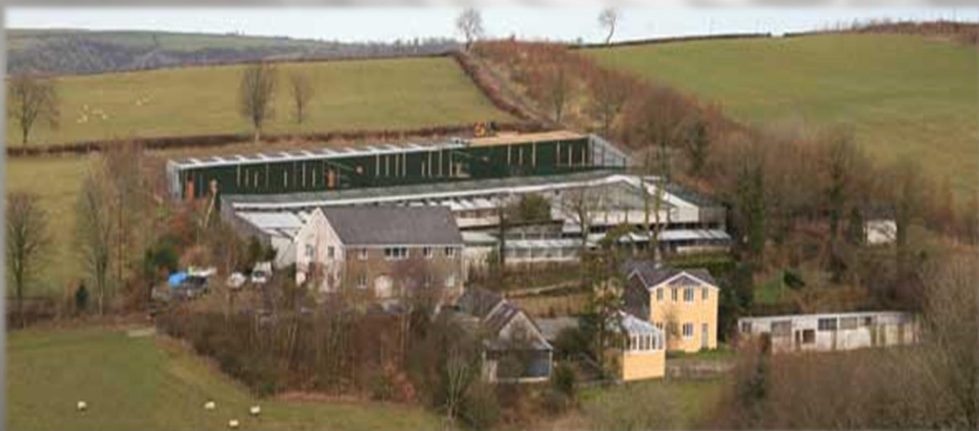
Main breeding facility in Wales