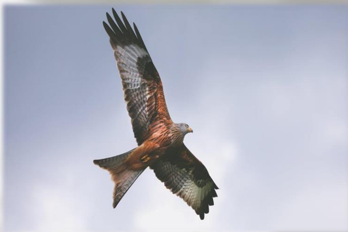
A wild red kite over the farm in Wales, continuing the success of the reintroduction in 1987

In 1985 the breeding population of Red Kites was down to 25 pairs, each pair seldom producing a single chick. So, Dr Nick Fox approached the Nature Conservation Council and offered to assist in the breeding of the kites and release the youngsters back into the wild. In 1987 the first kites were reintroduced after artificial incubation at our farm in Carmarthenshire.