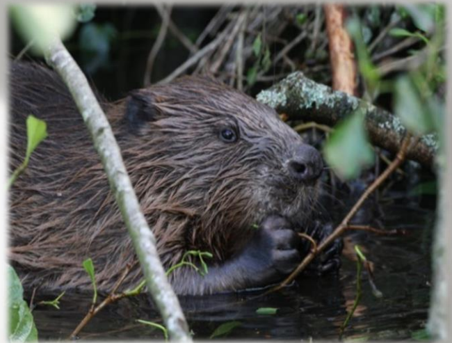
An adult beaver on one of our lakes situated on the farms.

Beavers must be monitored daily, yearlings relocated, and kits processed so the work can be very much hands on.