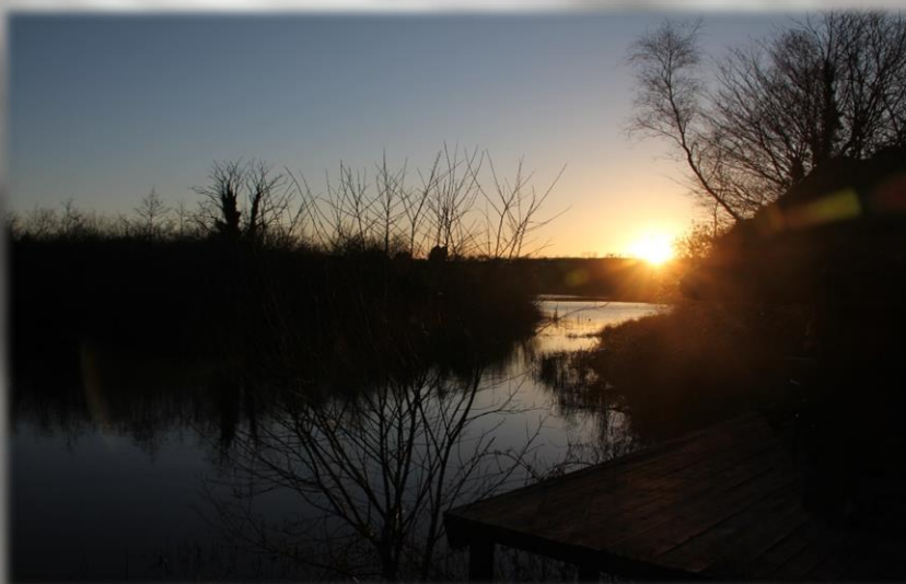
Sunset from one of our many wildlife hides